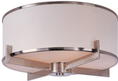
12050WTSN Nexus 3-Light Flush Mount