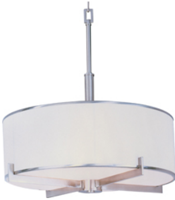
12053WTSN Nexus 4-Light Pendant