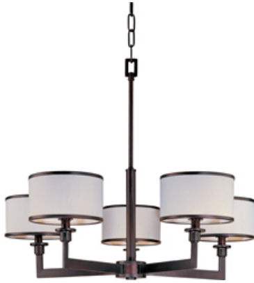
12055WTOI Nexus 5-Light Chandelier