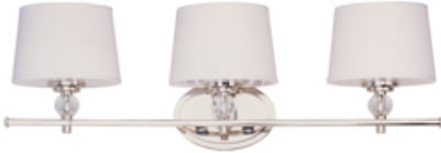
12763WTPN Rondo 3-Light Bath Vanity