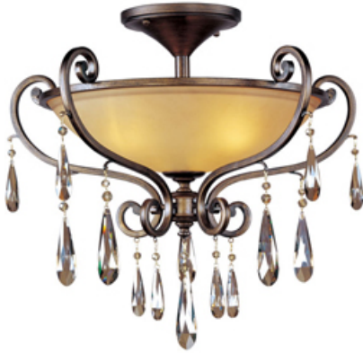
14302COHR Chic 3-Light Semi-Flush Mount