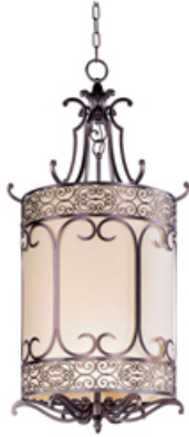
21159WHUB Mondrian 6-Light Entry Foyer Pendant