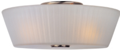
21500FTSN Finesse 3-Light Flush Mount