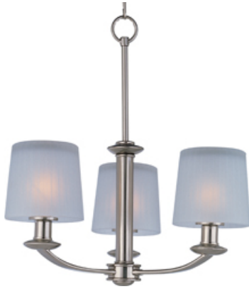
21504FTSN Finesse 3-Light Chandelier