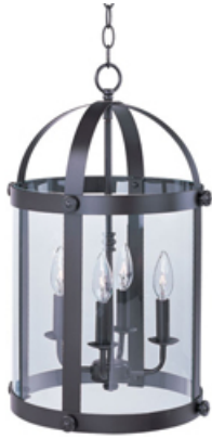
21550CLBZ Tara 4-Light Pendant