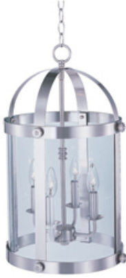
21550CLSN Tara 4-Light Pendant