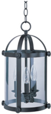
21552CLBZ Tara 3-Light Pendant