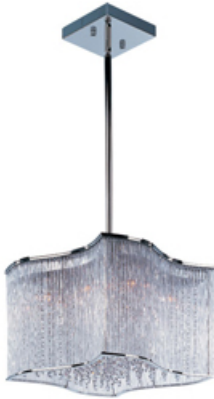
39704CLPC Swizzle 12-Light Pendant