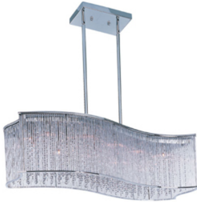
39707CLPC Swizzle 16-Light Pendant