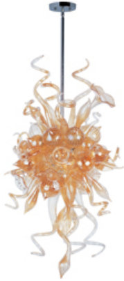
39723COPC Mimi LED 6-Light Pendant