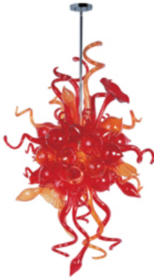
39723SRPC Mimi LED 6-Light Pendant