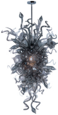
39725FMPC Mimi LED 18-Light Pendant