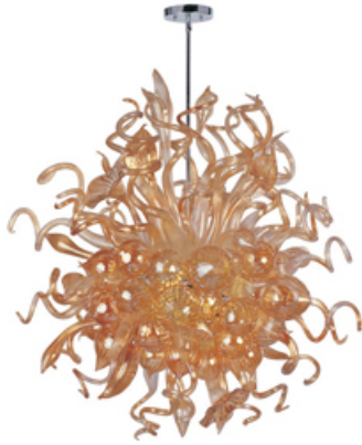
39726COPC Mimi LED 18-Light Chandelier