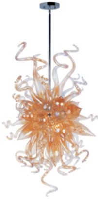
39733COPC Taurus LED 6-Light Pendant