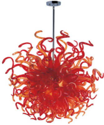
39735SRPC Taurus LED 18-Light Pendant