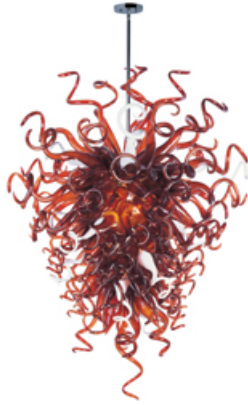
39736RBPC Taurus LED 18-Light Chandelier