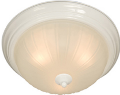
5832FTWT Essentials 3-Light Flush Mount