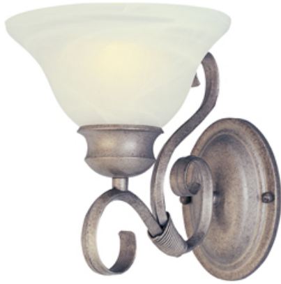
8021MRPE Pacific 1-Light Wall Sconce