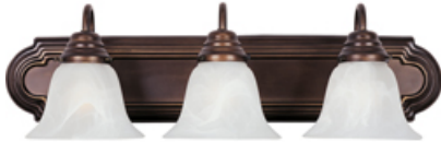
85813MROI Essentials EE 3-Light Bath Vanity