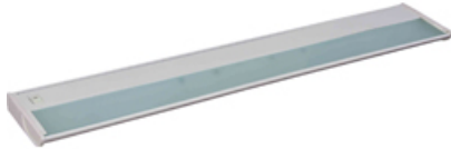
87834WT CounterMax MX-X120 40" 5-Light 120V Xenon