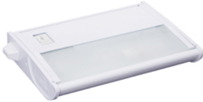
87840WT CounterMax MX-X120c 7" 1-Light 120V Xenon