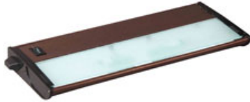
87841MB CounterMax MX-X120c 13" 2-Light 120V Xenon