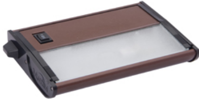
87859MB CounterMax MX-X12 7" 1-LT 12V Xenon Add-On