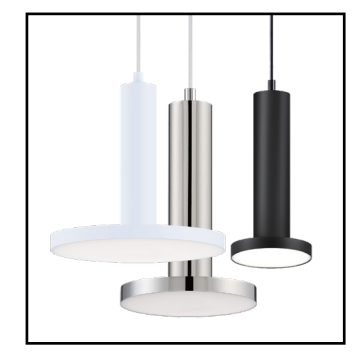
57600 PENDANT ACCESORY (Sold Separately, Fixture NOT included)