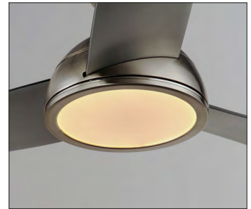
LED integrated dome