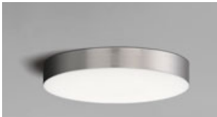
Accessory Empty EM 7" Shell