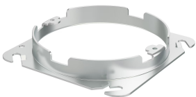
MSC8766 Mud-in Ring

Thin discs of evenly illuminated LED create the impression of recessed lighting. The die-cast aluminum housings are available in White, Black, Satin Nickel, and Polished Chrome all with a thoughtfully recessed White polycarbonate diffuser. High efficiency and good color rendering make this a perfect choice for your next project.