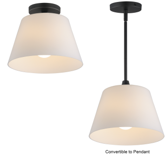
Convertible to Pendant