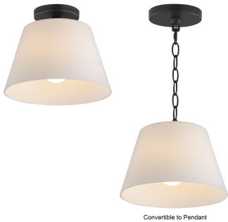
Convertible to Pendant