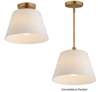
Convertible to Pendant