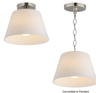
Convertible to Pendant