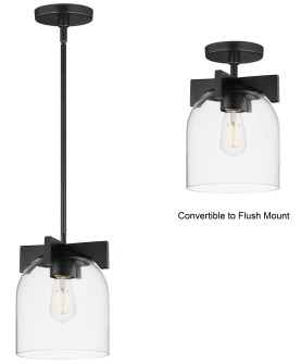
Convertible to Flush Mount