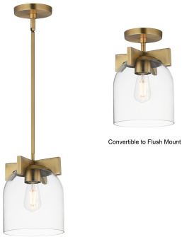
Convertible to Flush Mount