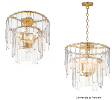
Convertible to Pendant