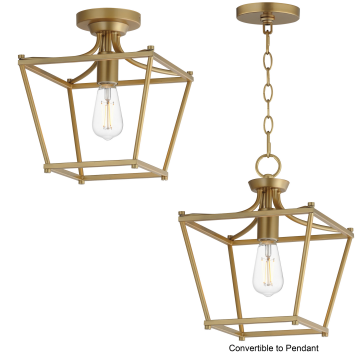
Convertible to Pendant