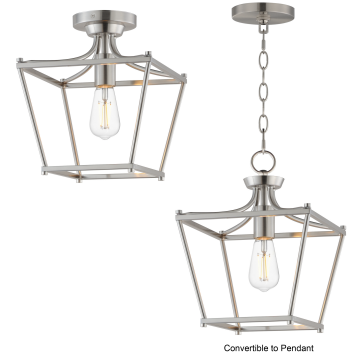
Convertible to Pendant