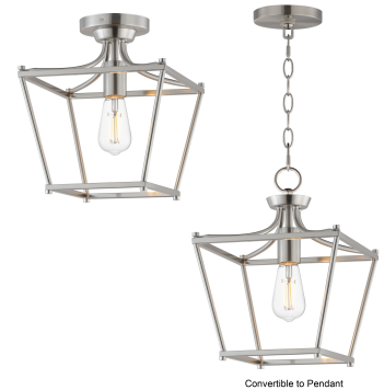
Convertible to Pendant