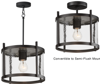
Convertible to Semi-Flush Mount

Squared columns in Matte Black finish tower above the cylindrical glass shade rated for outdoor applications. Available in a more modern clear glass option or hammered glass. A rectangular hook detail carries the square form through to the backplate. A modern interpretation of a bell tower, these outdoor pendants and sconces are a cleaned up, transitional look for exteriors.