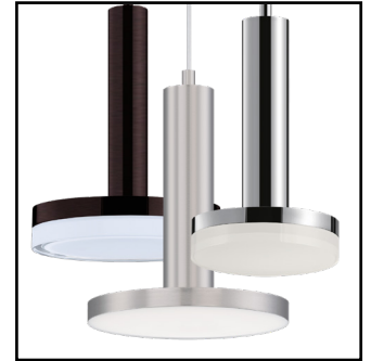
57600 PENDANT ACCESSORY (Sold Separately, Fixture NOT included)