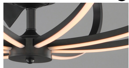
Always consult a qualified electrician before installing any lighting product.