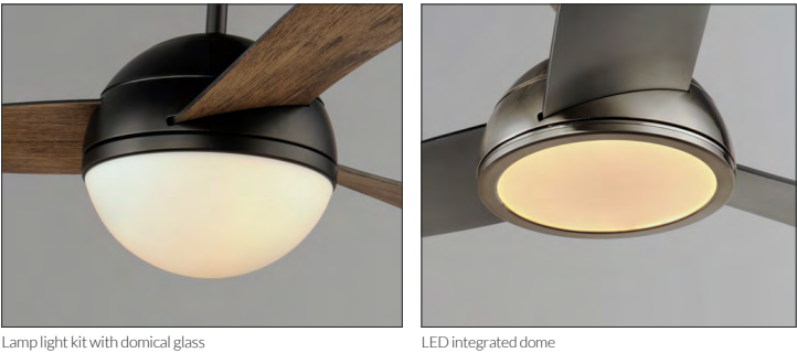
Lamp light kit with domical glass