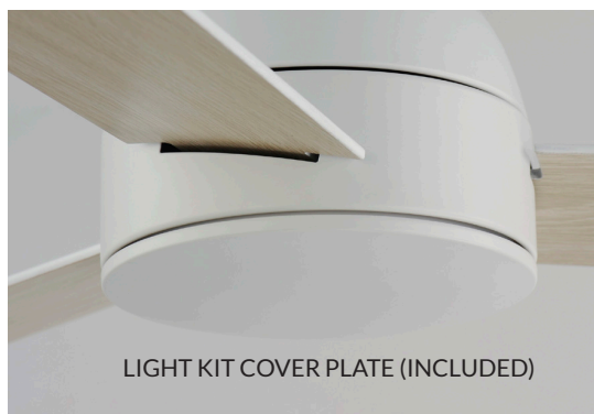
LIGHT KIT COVER PLATE (INCLUDED)