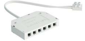
MSC89246P 6 Port Hub (24V)